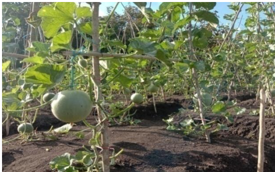
Gambar 7. Hasil Tanaman