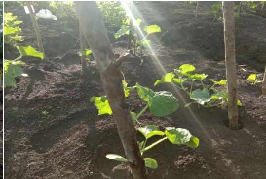
Gambar 4. Tanaman Berumur 14 HST