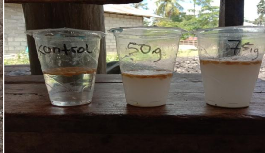
Gambar 2. Perendaman Benih Melon