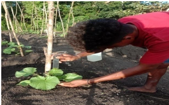
Gambar 5. Pengukuran Tinggi Tanaman