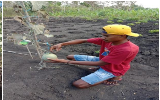
Gambar 8. Panen