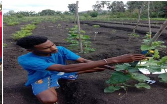
Gambar 6. Tanaman Berumur 28 HST