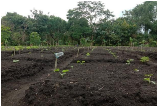
Gambar 3. Tanaman Berumur 7 HST