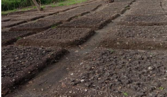
Gambar 1. Lahan Penelitian