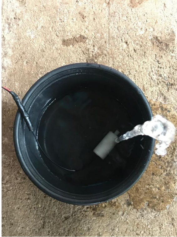
Gambar hasil pengujian Mini Water Pump